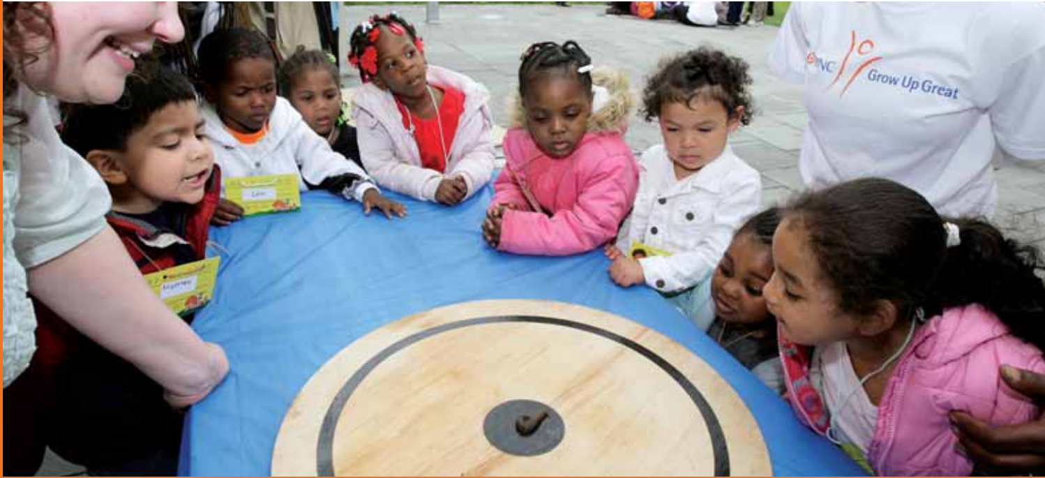
Preschool children watch a slug race and ask questions during a special event supported by the PNC Foundation's Grow Up Great with Science program.

T he Museum's Education Division serves teachers, community groups, and other organizations as a valuable resource about nature and science. School programs meet Delaware State Science Standards to complement teaching in the classroom while exploring themes that include habitats, adaptations, biodiversity, and fossils. Summer and holiday camps, scout and homeschool programs, preschool-style classes, birthday parties, and special events round out comprehensive educational offerings for youth in the region.