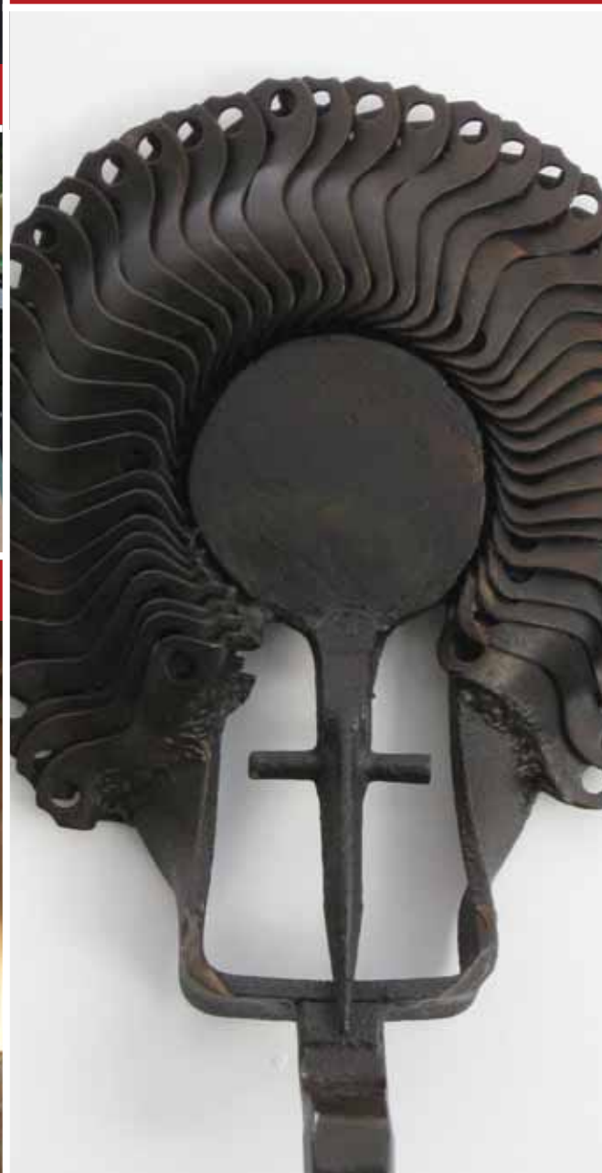
Sculptures by Stan Smokler took inspiration from nature in the Steel Currents exhibit.