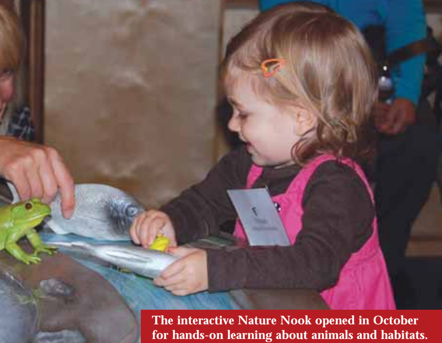
The interactive Nature Nook opened in October for hands-on learning about animals and habitats.