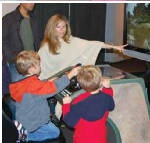
Special exhibits included Attack of the Bloodsuckers! (above left), Be the Dinosaur: Life in the Cretaceous (above right), and Tree Houses in 2010.