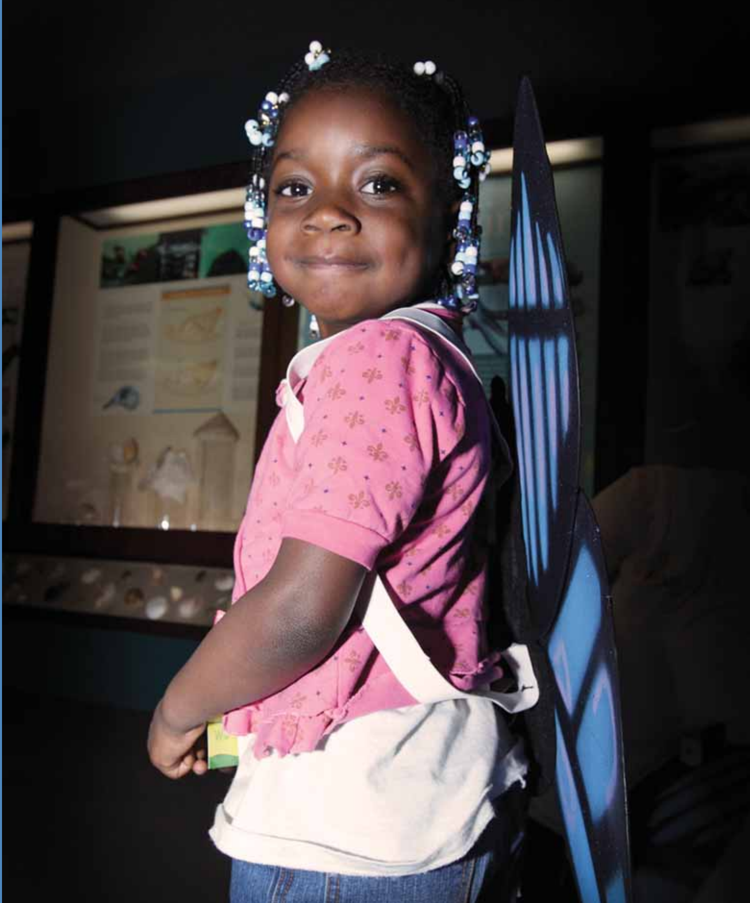
A preschooler tries on butterfly wings at a metamorphosis activity during a special event at the Museum sponsored by the PNC Foundation's Grow Up Great with Science initiative.